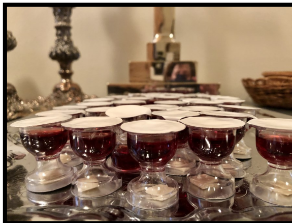
Pre-filled communion cups became a part of our services