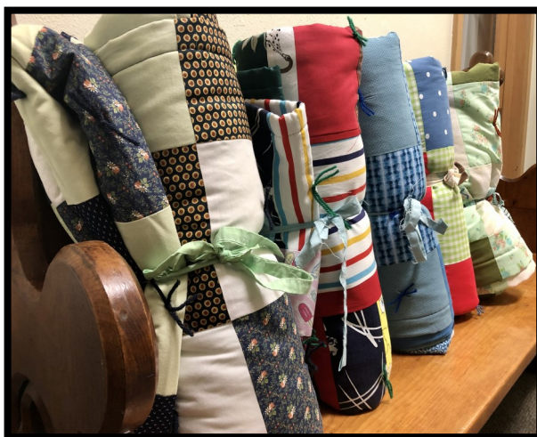
Handmade blankets from St. Paul Lutheran's sewing group were donated twice this season to the Coat Shed.