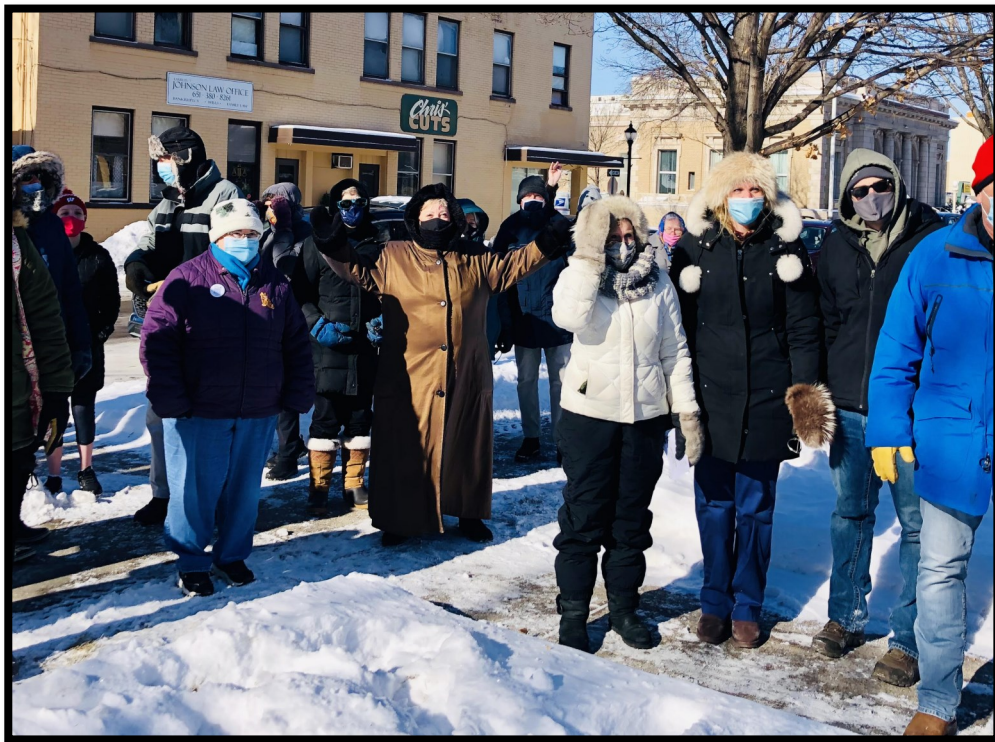
Members brave a cold February morning to ratify the actions taken during the virtual Annual Meeting.

After the vote, the meeting was adjourned and it being a very cold morning, (the low for the day was -24 F and the high -2 F) everyone went back home.