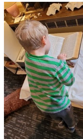
Archie reading the bible while setting the prayer table.