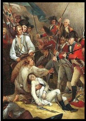
The history of the Episcopal Church is closely tied to the history of the United States. The church was founded after the American Revolution as the successor to the Church of England in the new country.