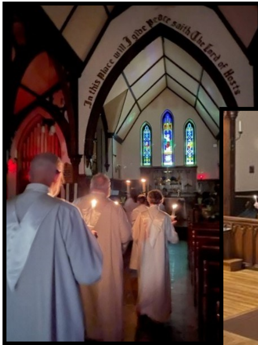
Easter Vigil 2022

The word Episcopal means “governed by bishops”. Each bishop traces his or her authority through a historical succession of bishops back to the earliest days of the Christian Church. There is no pope in the Anglican tradition; decisions are made by bishops and representative bodies such as General Convention, composed of bishops and elected laity and clergy delegates.