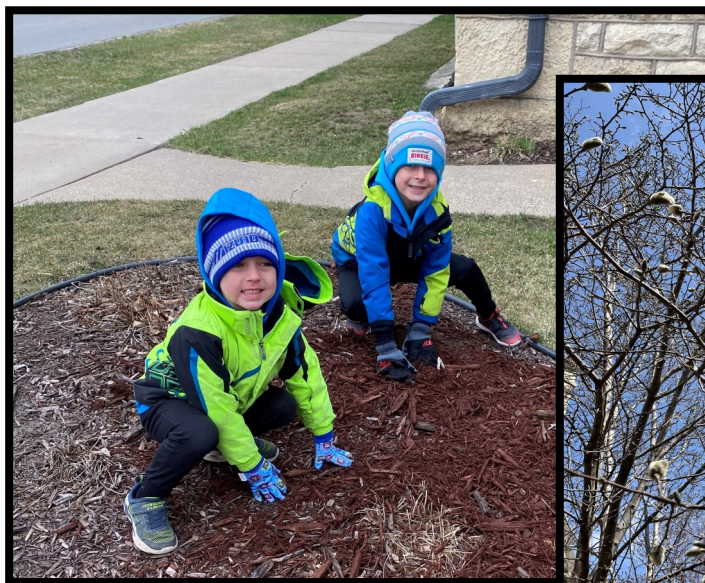
Spring, coming, but it sure is taking its time.