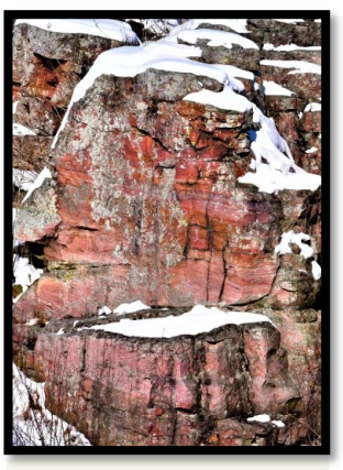
The Sacred Quarries of Pipestone Minnesota

Oral tribal histories say that for many centuries the land here was considered neutral ground where people were able to quarry for pipestone without fear. Pipestone was traded widely throughout North America and has been found in burial sites in Ohio that are two thousand years old.