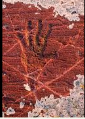
The Jeffers Petroglyphs site is an outcrop in southwestern Minnesota with pre-contact Native American petroglyphs.

How will you live into Jesus' radical call to listen to the Holy Spirit, see the unseen, care for the hurting, and love the unlovable?